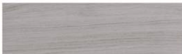
Gentle White Oak