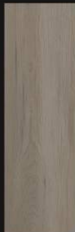
Grey Chestnut [PW 6110]

Blending modern aesthetics with timeless warmth, the cool grey undertones and deep chestnut grain were combined for their versatility.