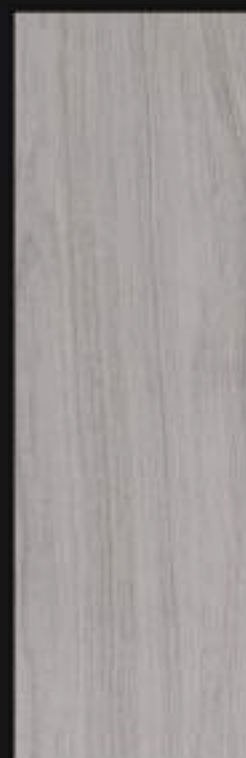
Gentle White Oak [PW 6111]

The pristine tones of Gentle White Oak with an authentic wood look creates tranquility in modern simplicity, creating a more cozy spacious feel to your homes.